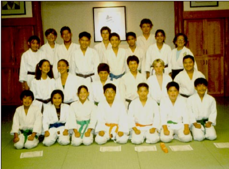
Maui Ki-Aikido’s advanced children’s class has just received a number of younger students who were recently promoted in the September 23 to 28 testing. Students of 5 th to 2 nd kyu, along with those 6 th grade and above in school, train together in the Thursday Intermediate and High School Aikido Class.

However, the children are learning not only a martial art but also the accompanying etiquette. This includes observing courtesy and respect for one’s teacher and one’s training partners on the mat. Aikido training also promotes self-confidence and a non-competitive release of youthful energy. Ki-Aikido’s goal is to train and develop the whole person and to instill healthy and wholesome values which remain with the student outside of the dojo and even beyond their actual training.