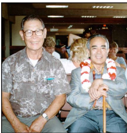
Shinichi Suzuki Sensei and Master Koichi Tohei on Maui, during our 1993 seminar, which was taught by Tohei Sensei.