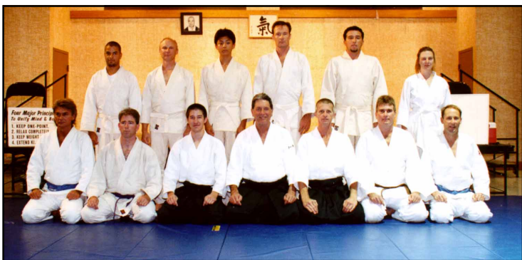
Participants in the adult upcountry class held every Tuesday night at the Tavares Community Center in Pukalani.